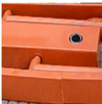
5. Tightened up the screws.