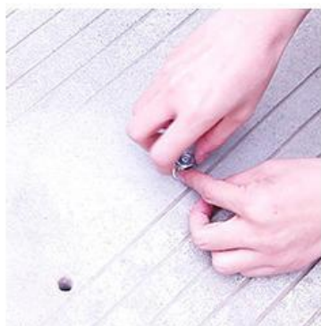
4. Fit the three screws.