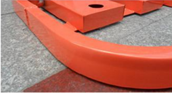
Thickening 2mm steel