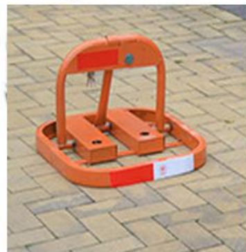
6.locked the bottom cap, installation is completed.