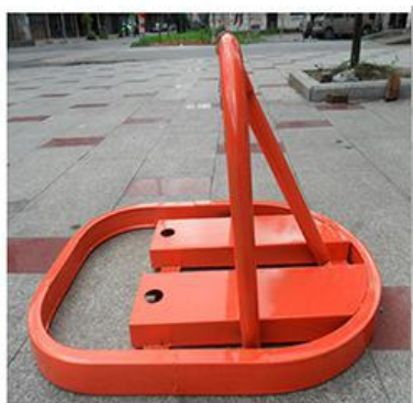
1.Place on the ground

# Manual operation: to operate the parking locks rising and going down manually with manual