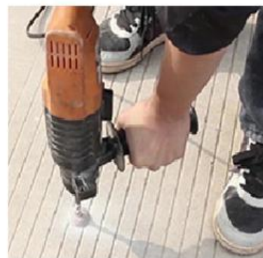
3.Use an electric drill to punch holes