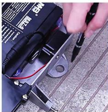
2.Make a marker