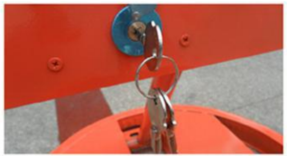
Durable - Pure copper core Lock