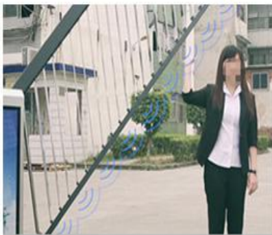
1. Anti-smash function.

Advertising Barrier added a special wind sensor, in the windy weather, the leaves of board will open automatically , in order to avoid damage the barrier. wind-force less than 8 level , The Ad board will not flip ; When the wind-force reached 8 level , The parts of machine will come into being three degree gap by wind , There will be no damage to the equipment