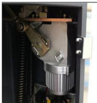
3.High-power motor movement