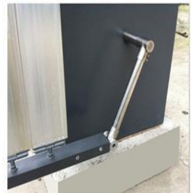
6.Windproof, power off automatically open the board