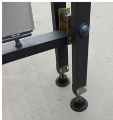
4.Double support column+ sucker and stiffener design