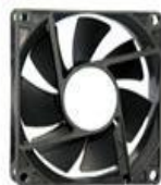
2. Good heat dissipation